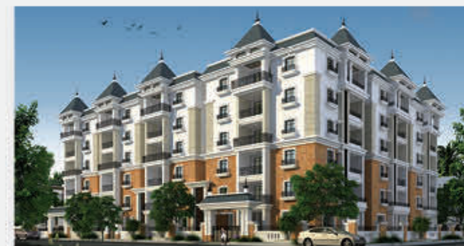
Sai's Spectra at Czech Colony