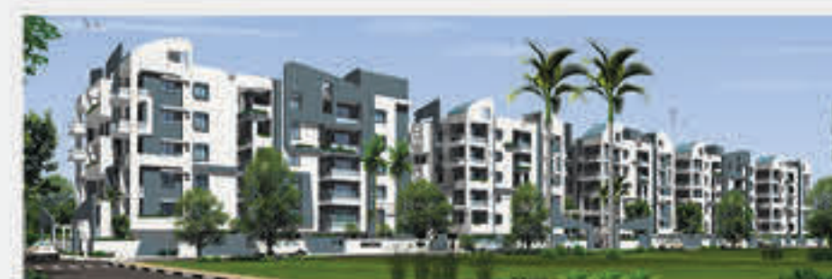
4 Square Elegant at Madinaguda