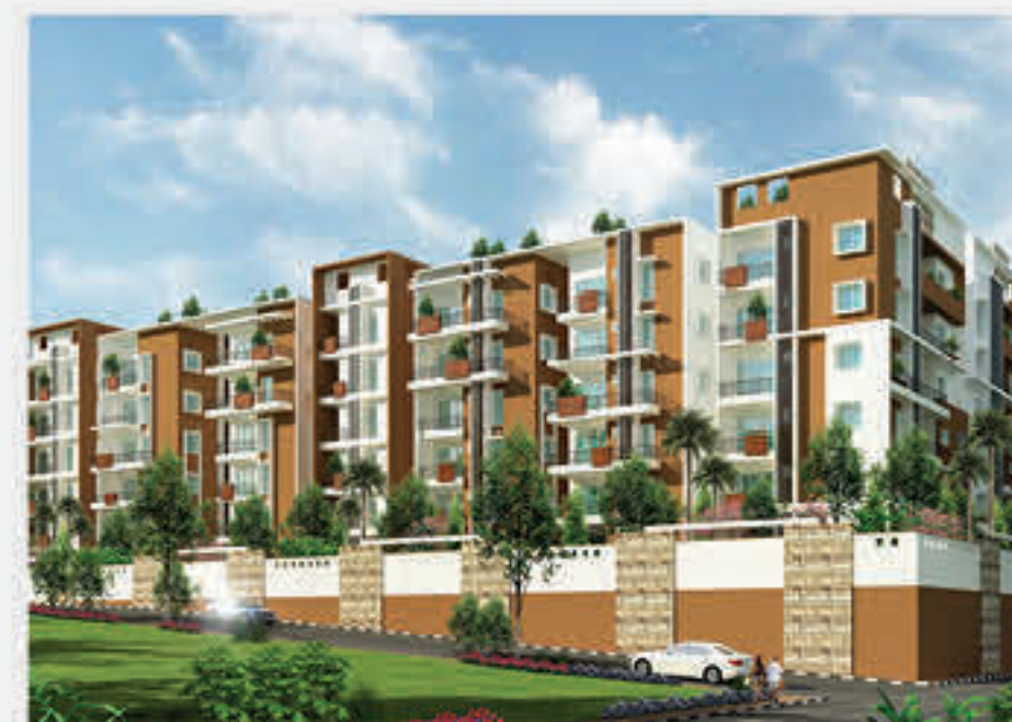
Sai's Four Seasons at Madinaguda