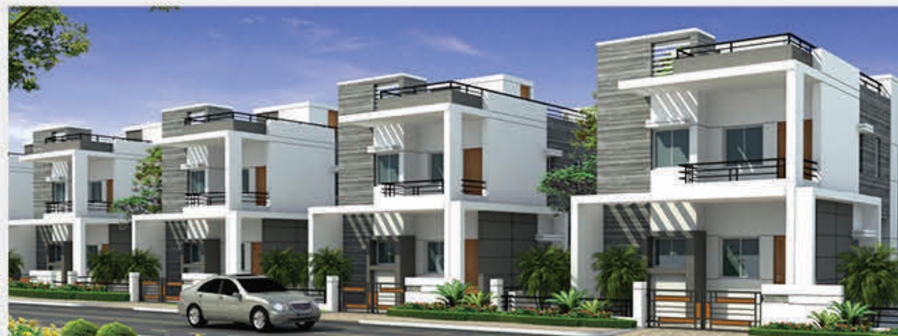
Villas at Bachupally