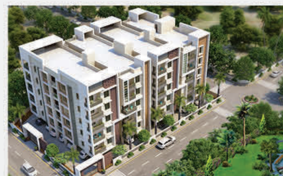
Sai's Splendid at Gachibowli